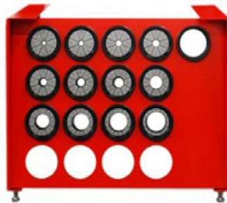
Option of quick change system for easy changing of dies and useful storage