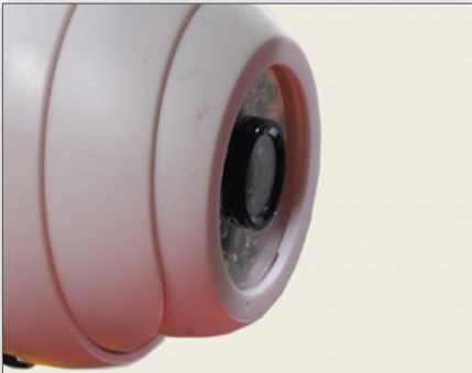
Option of a camera for onscreen view of the back of the head for fast and more accurate crimping (HydraTouch Only)