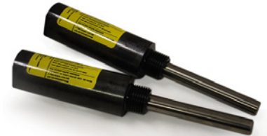
The HydraTouch version of the H50 features Gas strut return head with faster return times and reduced maintenance costs