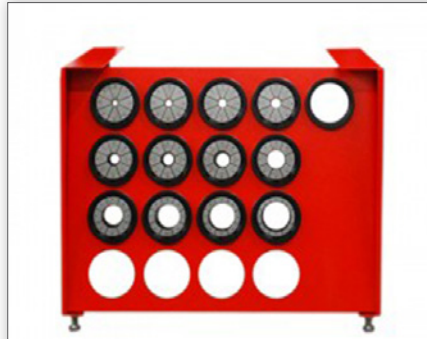
Option of quick change system for easy changing of dies and useful storage