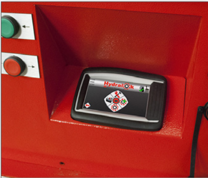
Touch screen controller