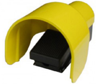
Option of foot pedal for hands-free operation (HydraTouch only)