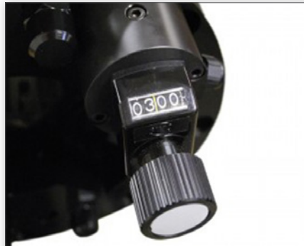
Simple dial adjusted calibrator